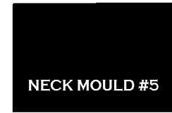
NECK MOULD #5