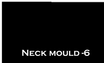
NECK MOULD -6